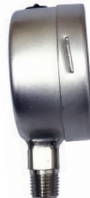
25SS Bayonet Bezel